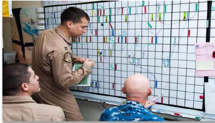
The whiteboard on which tanker refueling operations used to be planned.